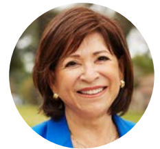
Mary Casillas Salas Commissioner City of Chula Vista