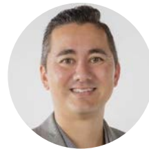
Chris Cate Commissioner City of San Diego