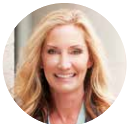
Kristi Becker Commissioner City of Solana Beach