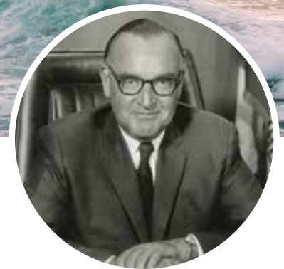
Governor Edmund "Pat" Brown Sr.