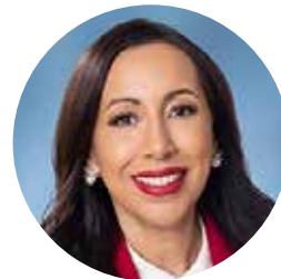
Paloma Aguirre Commissioner County of San Diego