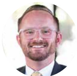
Dane White Commissioner City of Escondido